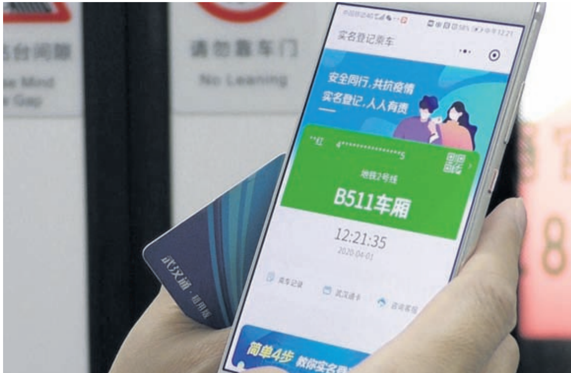
In this April 1, 2020, photo, a passenger holds up a green pass on their phone on a subway train in Wuhan in central China's Hubei province. Green is the "health code" that says a user is symptom-free and it's required to board a subway, check into a hotel or just enter Wuhan, the central city of 11 million people where the pandemic began in December.

If the code had been red, that would tell the guard that Wu was confirmed to be infected or had a fever or other symptoms and was awaiting a diagnosis. A yellow code would mean she had contact with an in-